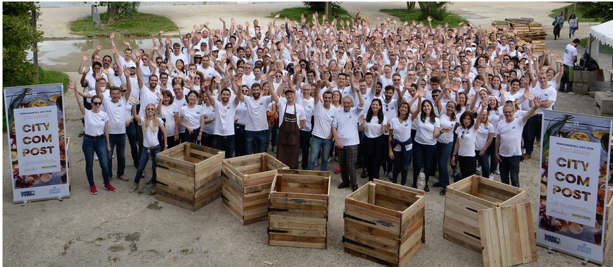
Responsib'ALL Day 2018 in Paris